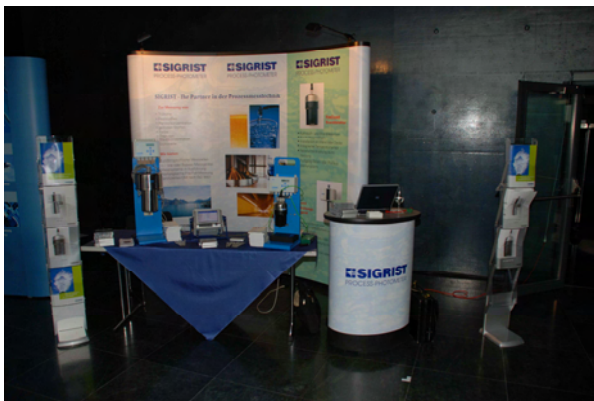
The SIGRIST-PHOTOMETER AG stand