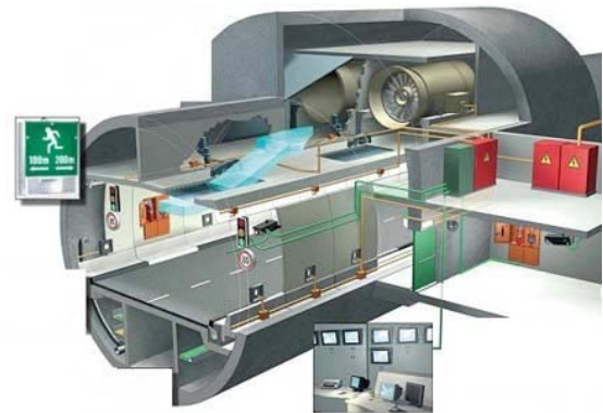
Picture: Section through a ventilation layout

High visibility in road tunnel tubes is an essential criterion for the layout of the ventilation system under normal traffic conditions, i.e. free-flowing, stop-and-go, congested traffic. A continuous assessment of the visibility serves as the main control variable for the correct and efficient operation of the tunnel ventilation during such traffic conditions. Visibility is impaired by particles resulting from combustion and by other particles. These other non-combustion particles originate from abrasion (brakes, tires) and re-suspension (swirling fine dust particles). During winter application of road salts also adds to the problem.