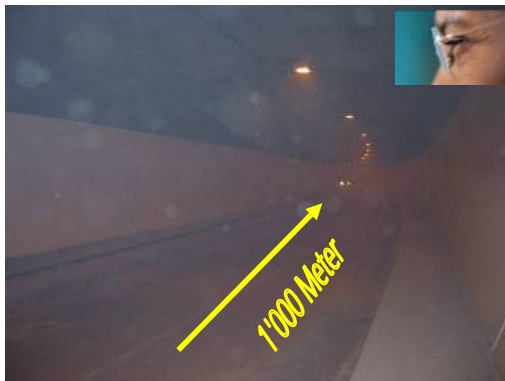
Picture: Decreasing visibility over distance

In tunnel ventilation, the extinction coefficient „K“ has become the customary measure for visibility. Most countries provide values for normal operation in their directives for the layout of tunnel ventilation. These lie typically at a value of K_{lim} = 0.005 \text{ m}^{-1} or 5mE/m (milli-extinction per metre). At a visibility of 12mE/m, the tunnel has to be closed for safety reasons.