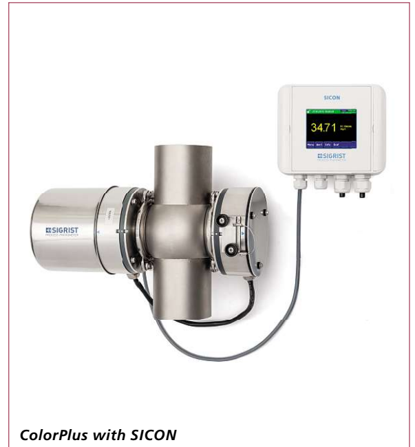
ColorPlus with SICON