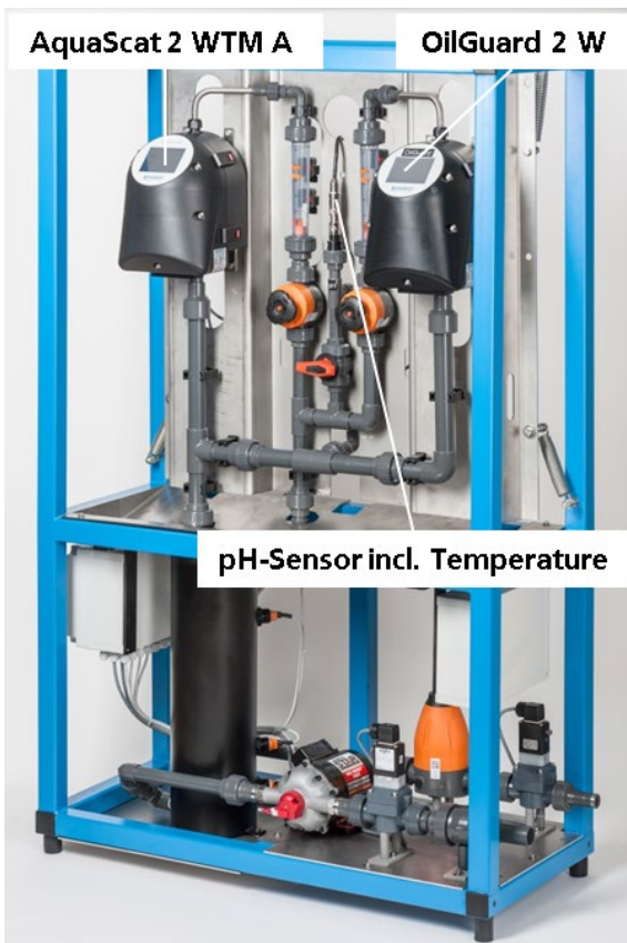
Figure 2: ScrubberGuard