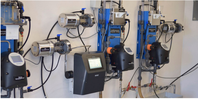
Figure 3: BactoSense installed in a groundwater well