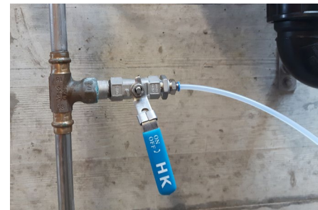
Figure 5: Simple control of the required water flow rate of 200 to 400 ml/min when continuously measuring with the BactoSense