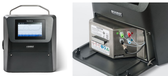
Figure 2: BactoSense with cartridge

It detects over 99% of all microbial cells and provides the results within only 20 minutes. Thanks to these measurements, actions can be taken to maintain a stable drinking water quality.